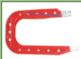
Part No: CA600wc (Optional)