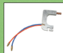
Part No: CAwheelarch (Standard)